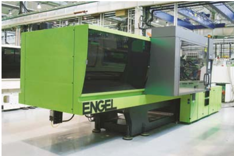
ENGEL victory (tiebarless) injection molding machine