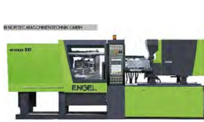
Injection molding machines - full elect. ENGEL e-max 200/100 No. 1786 , year 2007 screw size 25 mm injection shot weight in polystyrene 53 g/PS clamping force 1.000 kN