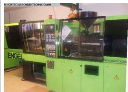
Injection molding machine up to 1000 KN ENGEL VC 330/80 Tech No. 1772 , year 2003 screw size 40 mm injection shot weight in polystyrene 181 g/PS clamping force 800 kN