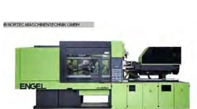
Injection molding machines - full elect. ENGEL e-motion 740/180 T No. 1785 , year 2007 screw size 55 mm injection shot weight in polystyrene 428 g/PS clamping force 1.800 kN