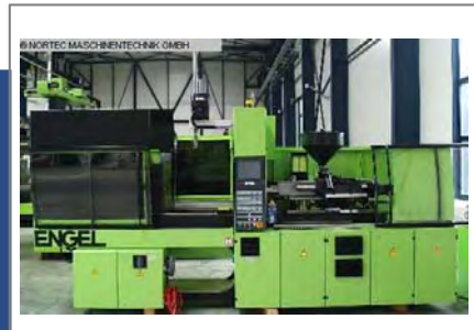
Injection molding machine up to 5000 KN ENGEL VC 500/120 Tech + ERC 13 F No. 1793 , year 2006 screw size 35 mm injection shot weight in polystyrene 173 g/PS clamping force 1.200 kN