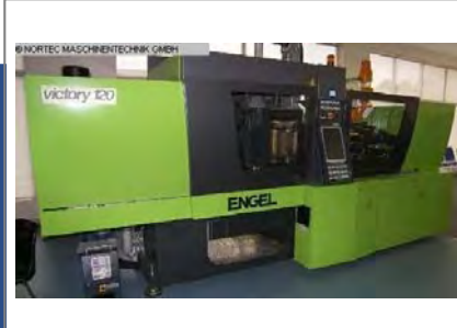
Injection molding machine up to 5000 KN ENGEL VC 500/120 TECH No. 1814 , year 2008 screw size 40 mm injection shot weight in polystyrene 226 g/PS clamping force 1.200 kN