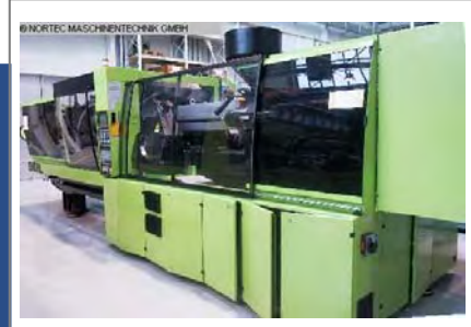
Injection molding machine up to 5000 KN ENGEL ES 2550/400 HL No. 1741 , year 2009 screw size 80 mm injection shot weight in PS 1.402 g/PS clamping force 4.000 kN