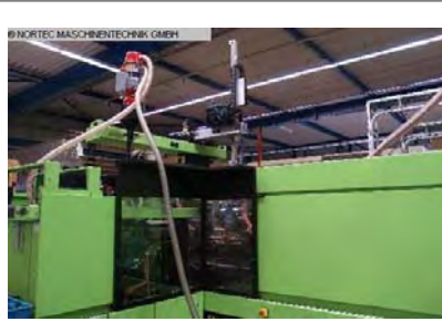
Linear robots ENGEL ERC 43/1-E No. 1831 , year 2000 X-axis demoulding stroke 500 mm Y-axis vertical stroke 800 mm Z-axis cross stroke 1.880 mm