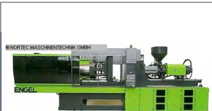
Injection molding machine up to 5000 KN ENGEL VC 650/220 POWER No. 1791 , year 2004 screw size 60 mm injection shot weight in polystyrene 662 g/PS closing pressure 2.200 kN