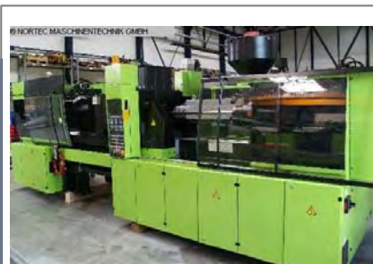
Injection molding machine up to 5000 KN ENGEL VC 1050/300 Tech No. 1780 , year 2006 screw size 50 mm injection shot weight in polystyrene 380 g/PS clamping force 3.000 kN