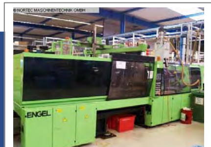
Injection molding machine up to 5000 KN ENGEL ES 1350/250 HL No. 1826 , year 1995 screw size 60 mm injection shot weight in polystyrene 662 g/PS clamping force 2.500 kN

ENGEL CZ S.R.O.; Baarova 309/18; 140 00 Praha 4; Czech Republic phone +420 211 04 29 00 ; fax +420 211 04 29 29 ; e-mail prodej@engel.at; www.engel.at