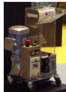
Granulator MODITEC Mini Goliath 2 No. 1464 , year 2008 engine output 1,8 kW ginding chamber dimensions 134x176 mm range L-W-H 400 x 245 x 580 mm