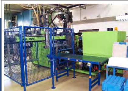
Linear robots ENGEL ERC 33/1-S No. 1532 , year 1996 X-axis demoulding stroke 400 mm Y-axis vertical stroke 800 mm Z-axis cross stroke 2.360 mm