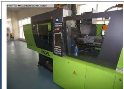
Injection molding machine up to 5000 KN ENGEL VC 750/150 TECH No. 1811 , year 2005 screw size 50 mm injection shot weight in polystyrene 360 g/PS clamping force 1.500 kN