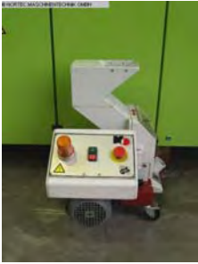
Granulator FRANZ MUELLER SM 82 No. 1760 , year 1997 engine output 0,75 kW ginding chamber dimensions mm total power requirement 0,75 kW