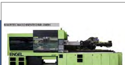
Injection molding machine up to 5000 KN ENGEL SPEED 180/55 No. 1787 , year 2006 screw size 50 mm injection shot weight in polystyrene 292 g/PS clamping force 1.800 kN