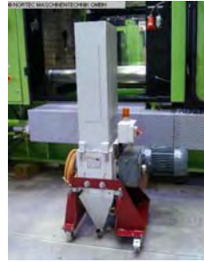
Granulator FRANZ MUELLER SM 210 No. 1758 , year 1998 engine output 5 kW Feeding opening 330 x 210 mm ginding chamber dimensions 230 x 210 mm