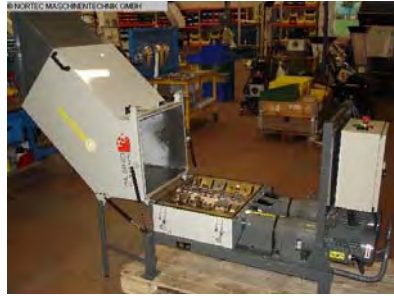
Granulator MODITEC Goliath GT9S No. 1775 , year 1999 engine output 2 x 1,8 kW Feeding opening 640 x 510 mm ginding chamber dimensions 504 x 457 mm