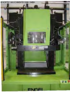
Injection molding machine - vertical ENGEL ES 80V/50 VT HL No. 0996 , year 1999 screw size 22 mm injection shot weight in polystyrene 35 g/PS clamping force 500 kN