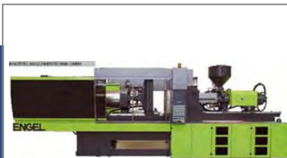
Injection molding machine up to 5000 KN ENGEL VC 2550/400 TECH No. 1810 , year 2005 screw size 80 mm injection shot weight in polystyrene 1.433 g/PS clamping force 4.000 kN