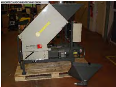
Granulator MODITEC Goliath GT 9S No. 1777 , year 2000 engine output 2 x 1,8 kW Feeding opening 640 x 510 mm ginding chamber dimensions 504 x 457 mm