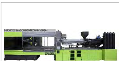
Injection molding machine up to 5000 KN ENGEL SPEED 280/70 No. 1788 , year 2006 screw size 70 mm injection shot weight in polystyrene 727 g/PS clamping force 2.800 kN