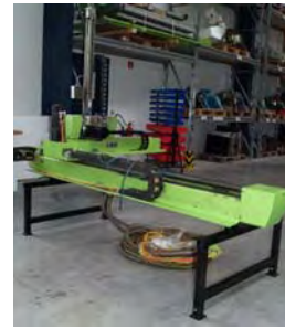
Linear robots ENGEL ERC 23/1-CH STAND ALONE No. 1543 , year 1996 X-axis demoulding stroke 650 mm Y-axis vertical stroke 800 mm Z-axis cross stroke 1.640 mm