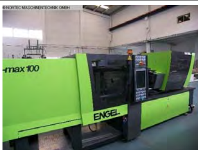
Injection molding machines - full elect. ENGEL e-max 310/100 No. 1815 , year 2008 screw size 35 mm injection shot weight in polystyrene 142 g/PS clamping force 1.000 kN