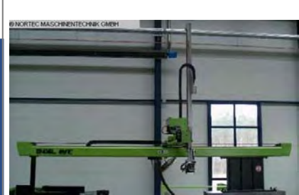
Linear robots ENGEL ERC 53/1-C No. 1621 , year 1996 X-axis demoulding stroke 650 mm Y-axis vertical stroke 1.300 mm Z-axis cross stroke 3.320 mm