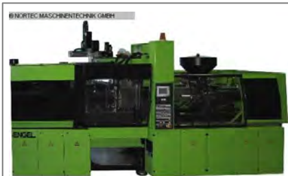
Injection molding machine up to 5000 KN ENGEL VC 650/150 Tech No. 1781 , year 2002 screw size 45 mm injection shot weight in polystyrene 226 g/PS clamping force 1.500 kN