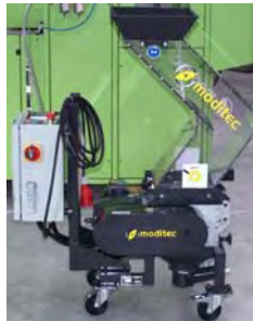
Granulator MODITEC GPlus 2 No. 1738 , year 2008 engine output 1,8 kW ginding chamber dimensions 229x265 mm Dimensions (HxWxD) 1156x485x1240 mm