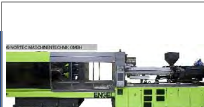
Injection molding machine up to 5000 KN ENGEL SPEED 280/70 No. 1789 , year 2007 screw size 70 mm injection shot weight in polystyrene 727 g/PS clamping force 2.800 kN