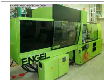
Injection molding machine up to 5000 KN ENGEL VC 1050/150 POWER + ERC 13 F No. 1808 , year 2006 screw size 55 mm injection shot weight in polystyrene 459 g/PS clamping force 1.500 kN