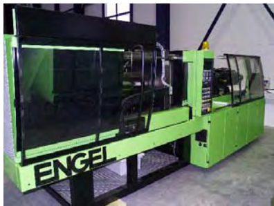
Rubber injection molding machine ENGEL ES 1350/250 H No. 1373 , year 1996 screw size 70 mm clamping force 2.500 kN