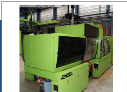
Injection molding machine up to 5000 KN ENGEL ES 1350/250 HL No. 1828 , year 1997 screw size 60 mm injection shot weight in polystyrene 662 g/PS clamping force 2.500 kN