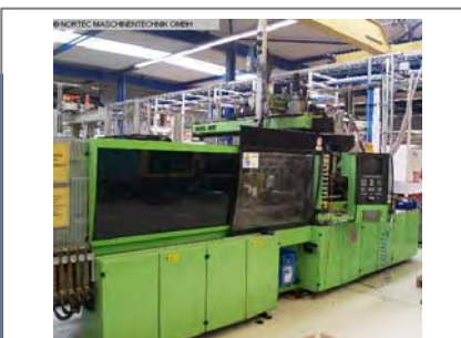
Injection molding machine up to 5000 KN ENGEL ES 700/200 HL No. 1834 , year 1992 screw size 60 mm injection shot weight in polystyrene 662 g/PS clamping force 2.500 kN