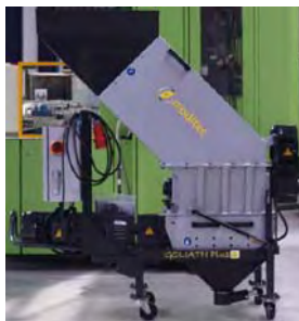
Granulator MODITEC GPlus 4 No. 1461 , year 2008 engine output 2,2 kW ginding chamber dimensions 228x453 mm Dimensions (HxWxD) 1510x485x1656 mm