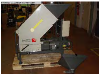
Granulator MODITEC Goliath GT9S No. 1776 , year 1998 engine output 2 x 1,8 kW Feeding opening 640 x 510 mm ginding chamber dimensions 504 x 457 mm