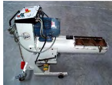
Granulator CONTINATOR MGK 250/175 L No. 1324 , year 2004 engine output 2,2 kW Feeding opening mm ginding chamber dimensions 250x175 mm