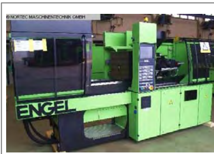
Injection molding machine up to 5000 KN ENGEL VC 500/110 TECH No. 1817 , year 2003 screw size 40 mm injection shot weight in polystyrene 226 g/PS clamping force 1.100 kN