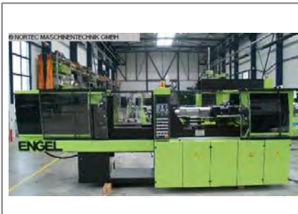
Injection molding machine up to 1000 KN ENGEL ES 500/100 HL-ST No. 1755 , year 1995 screw size 40 mm injection shot weight in PS 226 g/PS clamping force 1.000 kN